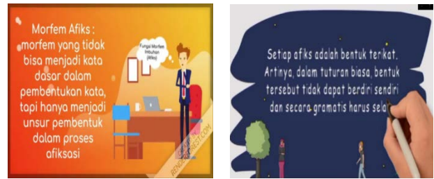
Figure 3 Examples of the appearance of Morphology course material

The contents of the material are in the form of descriptions and explanations of the material presented in the learning media. The following is an example of the appearance of Morphology course material in learning media that has been developed into Videoscribe.