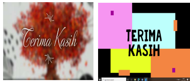
Figure 4 Examples of the display of the closing section of the Morphology course learning media

The closing part of the video contains a thank you to students/users of learning media. The following is an example of the display of the closing section of the Morphology course learning media which has been developed into a Videoscribe.