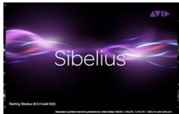
Figure 1. Sibelius Software first appearance ( https://www.avid.com/sibelius , 2021)

and Photo-Score which can even create the sheet music directly from singing or musical playing through a microphone or ready-made audio recording or can convert the printed or handwritten score to electronic musical forms with using a scanner. Now this software, which is continuously improving, is not only the perfect notation tool but also a versatile multimedia one [12]. This opinion was also emphasized, that Sibelius has complete features, is easy to use, and is compatible to be installed on various types of computer devices [13]; Sibelius is an application that can be used to perform all music writing activities, from writing music notation, making music, and playing it, so the Sibelius software is suitable for use in the training process for musicians.