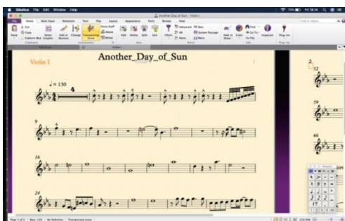
Figure 3. “Another Day of Sun” 1 st Violin Music Score (private documentation, 2021)

These soft skills certainly create new and more enthusiasm for members of the Pare String Ensemble Music Community. By being able to operate music software (namely Sibelius Software),