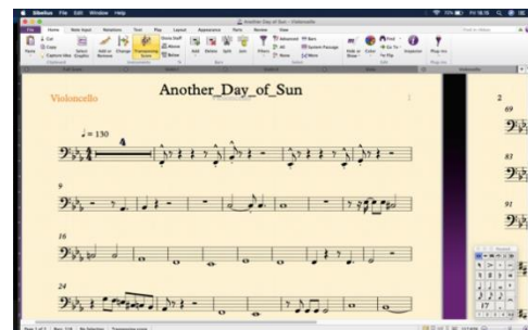
Figure 6. “Another Day of Sun” Violoncello Music Score (private documentation, 2021)

It opens opportunities for the community to produce musical works, which in the end, these musical works are not only a medium of existence for Pare String Ensemble music itself, but can also be used as a prospective business offer for service users in the neighborhood of the Pare String Ensemble Music Community, or for the wider community.