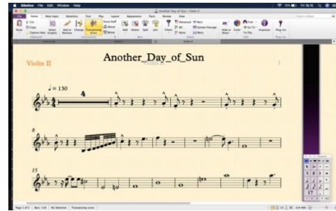
Figure 4. “Another Day of Sun” 2 nd Violin Music Score (private documentation, 2021)

These soft skills certainly create new and more enthusiasm for members of the Pare String Ensemble Music Community. By being able to operate music software (namely Sibelius Software),