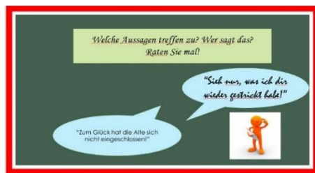
Figure 1. Exercise: Which statements are true?

It can be concluded that students' interest in three listening skills exercises that are very interesting to them are: Associograms, Discussion of topics, and Which statement is true. While the exercises that did not interest students were: Multiple-choice, True or false, and W-questions about a text. The following are examples of listening skill exercises: