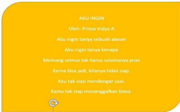
Figure 2 Example of second poetry text

The text of this first poem shows anxiety about the Covid-19 pandemic that has hit the world. The author wants Corona to disappear from the earth to meet up and gather with his friends and family without any restrictions. He could enjoy the view of the bustling city. Many people are selling, buying food, even just taking pictures with loved ones. The author hopes that Corona will go away soon.