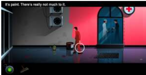
Figure 3 The Silent Age game screen ‘present time’

janitor who finds a time machine tool that he can use to save the world. The world setting in this game is separated into two timelines. The current time is shown as a world in the 1970s, and the future time is shown as the post-apocalyptic world that is being visualized as a world with many damaged objects and wild plants scattered around that world. Players are given the freedom to explore both of the periods, in order to solve the puzzles given through the gameplay. The players can also have a dialogue with NPCs, and enjoy the visual changes of both periods that are clearly presented in the game.