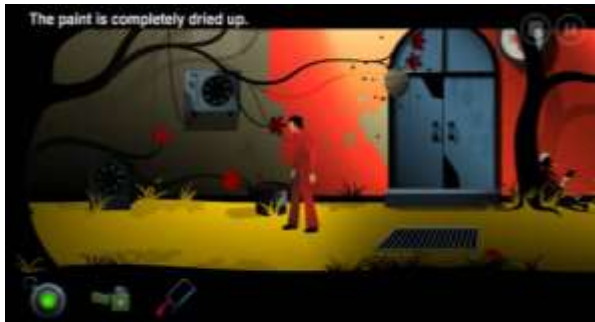
Figure 4 The Silent Age game screen ‘post-apocalyptic time’

The second game is a game called “Machinarium” that is available for both iOS and android platforms. This game offers a different approach to the players, as there is no dialogue given to players in this game. Players are given a challenge to figure out the task and gameplay through the interaction they do with the objects that are presented in the game. They also need to understand the storyline by themselves as they keep solving the puzzles given. Players will play the character of a robot, who is on a journey to save his lover. The visual appearance of this game is very detail oriented, and also won the best visual art award at IGF(Independent Games Festival) in 2009. The representation of dry plants, the brownish monochrome colors this game has, and the visual elements of the objects which are mostly metal, make