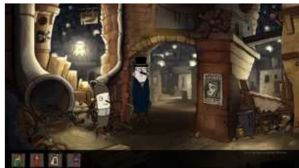
Figure 6 The Inner World game screen

The third game is a game called “The Inner World” which can be found on PC, Mac and android platforms. This game has a storyline about a fantasy character named Robert, who lives with other citizens in the underground world, and goes on an adventure with a thief named Laura, to find out the truth about the world they already live in. The Inner World presents some animated interludes in the middle of the game, which is very entertaining for the players. The world setting that is formed in this game is an underground city. The color tone used in this game tends to be gloomy and monochromatic brown, like the Machinarium game that was already discussed earlier. Many dry plants and metal waste visuals were found scattered throughout the game, as a representation of an unhealthy environmental situation. However, the cartoon visual style that is being used in this game, and the stupid behaviour that the characters in this game presents, brings the humorous and funny atmosphere that make this game enjoyable for all ages.