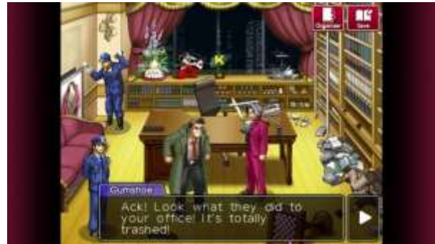
Figure 2 Ace Attorney: Miles Edgeworth game screen

The representation or visualization of the world in the game is the first thing that the players see when they start to play an adventure game. Therefore, it becomes an important key for the designer to be aware of. Players must be able to guess and feel the theme of the game that will be presented, just by looking through the visual world that is being presented to them [9]. Usually, in the intro of adventure games, players are given the opportunity to explore the world, interact with non-player characters (NPCs) and objects in the world.