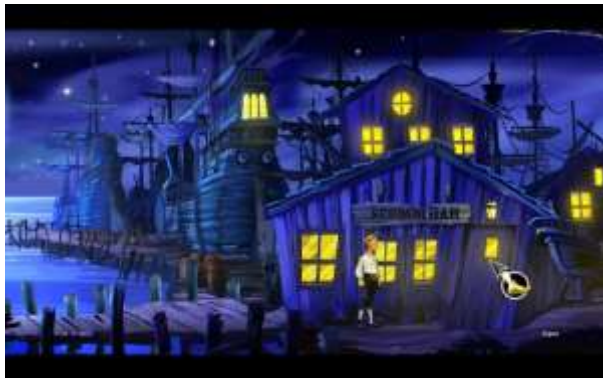
Figure 1 The Secret of Monkey Island game screen

The "world" is a very important aspect in adventure games. It is through this world that both the storyline and the space in the game are presented to the player. For example, the representation of the world presented in The Secret of Monkey Island game, which has a theme and characters who live as pirates, looks different from the game Ace Attorney: Miles Edgeworth , which has a theme and characters who live as prosecutors. This is due to the different approach that both of the games want to show the player. Each object displayed in the game, has been adjusted to the theme that the designer wants the player to feel.