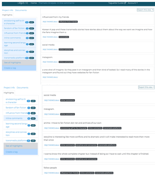
Figure 2: Coding analysis in Targuette.

The content analysis revealed six themes that emerges from Wattpad storytellers of the Malaysian undergraduates. However, only one theme will be discussed in this finding which is about inline comments. Figure 2 depicts the results from coding