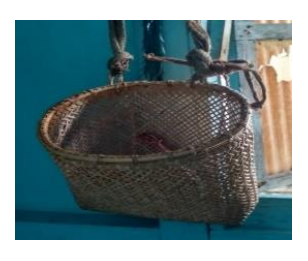
Figure 12. Okang

Okang is another name for a crock used as a probaya palm wine store. The okang lid will be opened after the end of the probaya breaking event and the