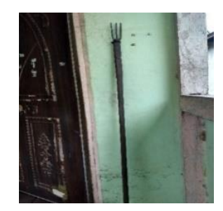
Figure 7 Serampang

This serampang, if explained traditionally, is used to protect oneself from all wild animals and is also used to look for side dishes. The stalk is rectangular in shape.