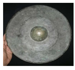
Figure 6 Gong

Gong is also a tool used to call all villagers to come to the place of the person holding the traditional wedding at home. Gong is also used when explaining customs to the bride or groom. The shape of a circle if you look at it from the surface, but if you look at it again, the gong has a space inside and is in the shape of a hemisphere, the mathematical concepts contained are included in the shape of the space and the shape is flat.