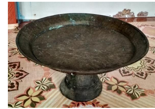
Figure 2 Par from the front and from above

Lintang Pelaman Village has its own customs and traditions as well as the wedding tools used, one of which is Par, its function is to store Probaya open materials used for traditional wedding events. The surface of Par resembles a circle if the top is seen as a whole like a half ball while the legs of Par resemble a cone, as shown in Figure 2.