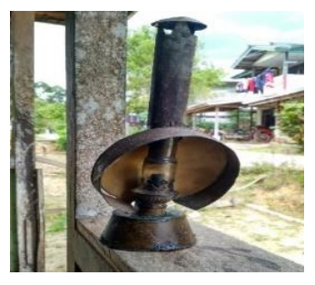
Figure 8 Lotos

Lotos if interpreted traditionally to illuminate the path of the bride and groom. Lotos were also used by the indigenous Dayak Pompak'ng people to illuminate when hunting and fishing. The lid of the lotos funnel is in the shape of a cone, the lotos funnel is in the form of a tube, the center of the guard is circular, and the feet of the funnel are truncated in the shape of a cone, mathematical concepts that are included in spatial and flat shapes.