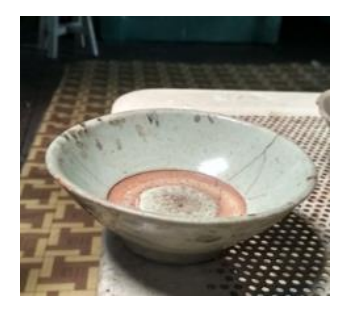
Figure 4 Sangkal Bowl

Sangkal bowl is a tool used in the traditional Dayak Pompak'ng wedding tradition. The function of this sangkal bowl itself is to store the ingredients that will be used in the probaya breaking event, the peak event in the traditional Dayak Pompak'ng wedding tradition. Sangkal bowl, if interpreted according to tradition, the bride and groom who divorces will be subject to customary sanctions. The bowl of denial is also used as a measure of error in accordance with applicable customary law. The bowl denies when viewed from a circular surface, the mathematical concepts contained are included in a flat shape.