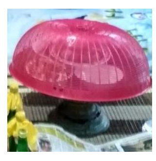
Figure 5 Tudung probaya

Tudung probaya is one of the tools used in the traditional wedding tradition, the function of this hood is to cover the probaya materials stored above par. This Tudung probaya will be opened when the event reaches the peak of this traditional wedding, which is called Buka Probaya. If you look at the Tudung probaya in the shape of a hemisphere, the mathematical concepts included are included in the spatial structure.