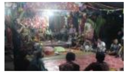
Figure 14. Nomar probaya (inaugurate the bride or groom

Nomar probaya is the culmination of the traditional wedding of the Dayak Pompak'ng ethnic group. At the time of the probaya nomar event, there were also