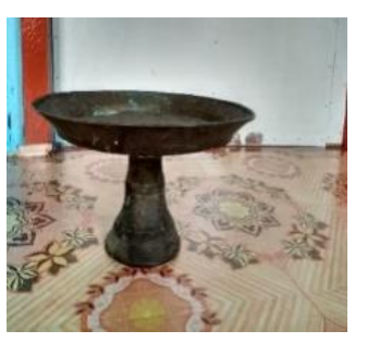
Figure 3 Par

Par is one of the tools used in the traditional Dayak Pompak'ng wedding tradition. Par is made of copper and has been used for generations since ancient times. Par is also used to store Probaya ingredients used for traditional wedding ceremonies. Par when viewed from the base surface is circular and there is a cone that is cut off at the foot of par. The mathematical concepts included are included in the spatial and flat shapes.