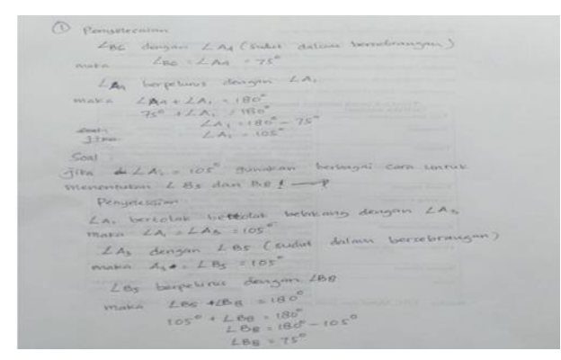
Figure 1 High-ability student's answer for question 1.

Looking at the average percentage of all indicators of 26%, there is no indicator that exceeds 50%. The highest average percentage is found in the flexibility indicator, which is 42%. It can be said that the average creative thinking ability students are still not satisfied. Furthermore, each student's answer will be discussed on each indicator.