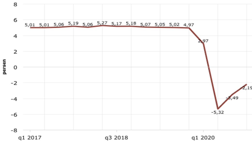
Fig. 2. Indonesia's Annual Gross Domestic Product Growth Rate (Year on Year/YoY) [12].

Hereby is the data in regards to the economic condition of Indonesia based on the date that was released by the Central Bureau of Statistics (BPS) [12]: