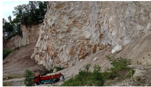
Fig. 2. Loading and Unloading of Rocks in the Middle of the Hill Location.

stones and soil has been going on for a long time, even the depletion of hills in the city of Bandar Lampung is the result of these mining activities. Based on field observations, several hills in Bandar Lampung City have suffered severe damage due to mining practices. Some of these hills are Langgar Hill, Balau Hill, Turmeric Mountain, Klutum Hill, East Camang Hill, Foot Hill of Mount Betung, Hatta Hill, Sukamenanti Hill, and boat mountain (Field Observation Results).