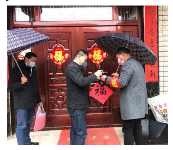
Figure 1.Implementation of the quarantine policy during the Chinese New Year

and reject themselves to be quarantined. With the protection of the law, most people followed rules and regulations.