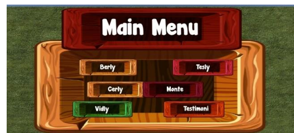
Figure 2. Civic Caring Apps Menu

The presence of this application can be the solution in the development and improved positive character of learners, through understanding the wise use of information technology. So, in use it will increase both effectiveness and efficiency as media in the process of developing the character of learners. This application scheme has features to compile the character of participants, the menu found in: