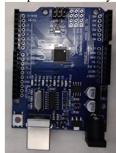
Figure 3. Arduino Board Circuit.

This research uses the Arduino Uno microcontroller, as shown in figure 3, which has been programmed into it using the C programming language. In the design of automatic door openers-based Arduino UNO uses HC-SR04 ultrasonic sensor, there are three main parts: the input (input), process (process), output (output). The third part is the basis for determining the performance of the prototype automatic door openers-based Arduino UNO uses ultrasonic sensors. These three parts must be interconnected and linked to each lain. It can be said that the three parts are already said to be a system.