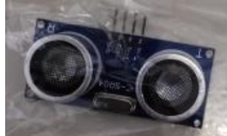
Figure 2. Ultrasonic sensor.

electricity as its energy source. This tool is used as a driver of a system that requires a shaft lengthening and shortening work system to open the door.