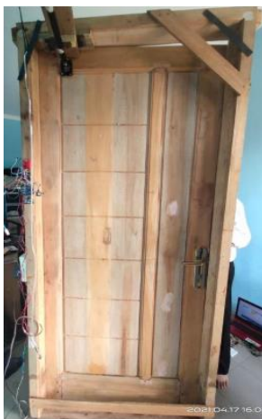
Figure 4. Installment of Door Opener

This hardware test is to find errors or deficiencies in the Arduino UNO R3-based automatic door opener prototype using the HC-SR04 ultrasonic sensor. Especially on the hardware components used in building the system. The purpose of testing and analysis performed on ultrasonic sensors is to obtain parameters about the accuracy of the distance detected by the sensor. This is done to get maximum results for the detected hand wave distance so that the test results of the ultrasonic sensor HC-SR04 are shown in Table 1.