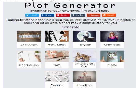
Figure 2 Plot Generator webpage

The AI used in this study was a free web-app called Plot Generator that can be accessed from https://www.plot-generator.org.uk/ . This app offers the creation of a wide range of plots, such as movie scripts, opening lines, fairy tales, opening lines, and short stories (see Figure 2).