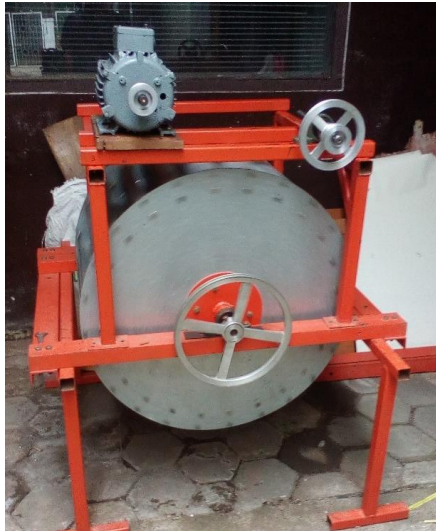
Figure 3 The two-stage pulley transmission for coupling of single-phase ac permanent magnet generator and low head hydro turbine.