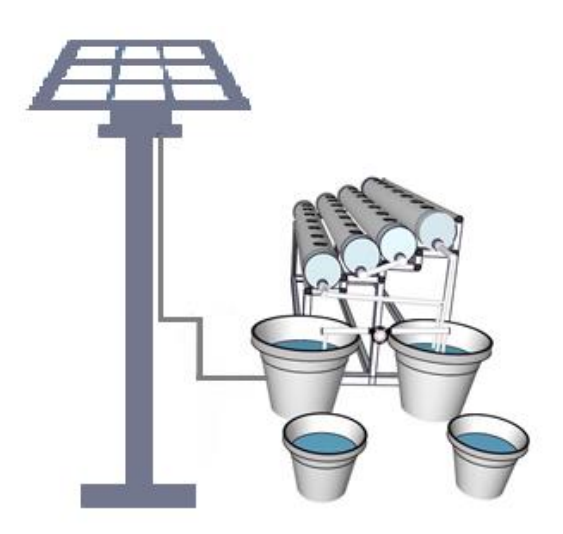
Figure 3 Hydroponic Design

To increase the production and growth of vegetable crops, a new technology is needed, so that hydroponics with the NFT system can be an alternative technology in planting. In this way the use of agricultural land can be minimized along with the current narrowing of agricultural land.