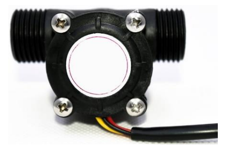
Figure 2 Water Flow Sensor

A water flow sensor is a measuring instrument used to measure the discharge or volume of fluid flowing in a closed pipe or open channel such as a river, ditch or culvert. The type of fluid measured with or with water flow can be liquid, gas, or solid. When using water flow to measure flow in terms of flow rate, flow rate and volume or weight of fluid, it has a wide range of applications. The application of a water flow depends on the purpose and benefits, and depends on the situation that needs to be engineered for the installation of the water flow to meet the objectives and benefits. However, the function of the water flow sensor remains unchanged, namely measuring the flow rate.