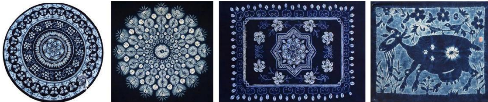
Figure 2 Tie-dye patterns of Bai nationality in Dali (picture source: finished by the author).

are good at discovering beautiful patterns in nature, subjectively transforming them, permuting and combining them to create symmetrical shapes. ("Figure 2") Besides, under the influence of religion and society, there are also figures and architectural symbols. In Tian Shun's "Research on the Architectural Image in the Tie-Dye Craft of the Bai Nationality", it is clearly pointed out that the Bai people draw on the architectural image of the traditional Bai nationality's dwellings in the process, of extracting the tie-dye pattern, such as the architectural image of the plum windows, mirror walls and other architectural components [4].