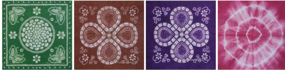
Figure 1 Tie-dye colors of Bai nationality in Dali.

blending of colors gives people a feeling of misty clouds and mists.