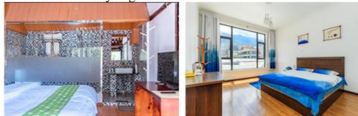
Figure 3 A tie-dye theme homestay with characteristics of Bai nationality in Dali.

First of all, the current tie-dye themed homestays generally lack a sense of space and atmosphere, and the creation of the sense of atmosphere is mainly reflected in the selection of colors and materials. In the two selected homestays, the selection and collocation of furniture are not exquisite, there is no main color tone in the space, and the collocation of furniture materials makes the space look stiff. The matching of dark wooden furniture, wooden floors, white walls, mosaic tiles, and glass curtain walls is inconsistent. The interior furnishings have nothing to do with Dali's customs and tie-dyeing culture. The space style lacks uniformity and does not reflect the cultural atmosphere and decorative effects of tie-dyeing art.