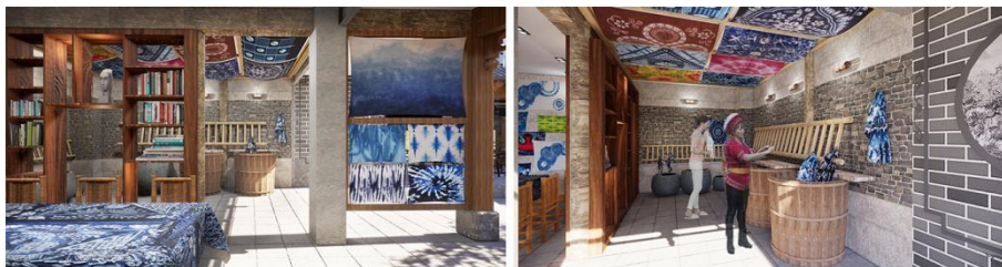
Figure 5 Design of Dali tie-dye theme homestay design effect picture of tie-dye experience workshop (Image source: self-painted by the author).

While providing accommodation and catering services for tourists, homestays are also a platform for tourists to provide cultural exchanges and cultural experiences. They should fully demonstrate national cultural characteristics and be the inheritors and spreaders of local culture, and the inheritance of culture should not just float Communication at the visual level should enhance the interaction and participation of visitors with culture, and it needs to enrich the experience and interactivity of spatial functions. If an interactive and experiential tie-dyeing workshop can be added to the interior space of the homestay, visitors can have a more intuitive understanding of the tie-dyeing skills of Dali and increase the interactivity and interest of the homestay space. ("Figure 5") Integrating regional culture into the homestay design can better protect the local culture and customs of the area and enhance the cultural literacy of the area, so that foreign tourists can better understand the local traditional culture, enhance the awareness of protection, and better inherit the excellent traditional culture and intangible cultural heritage.