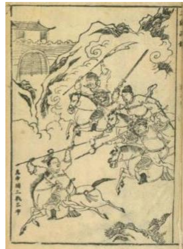
Figure 3 'Three Young Men Battling Against Lv Bu at Hulaoguan', Statue of the Three Kingdoms. (Da Kui Tang Collection).

The five-color porcelain in Kangxi Regime is an outstanding example of the porcelain art in the Qing Dynasty, representing the highest level of the art. The colours are vivid and bright, the subjects are rich and varied, and the designs are exquisitely drawn, with a warm and calm artistic style. During the Ming and Qing Dynasties, woodcut pictures developed and matured relatively quickly, and a large number of illustrations of opera and novel appeared, with "more than 30 types of engravings in the Ming Dynasty alone, and up to 70 types 1 [5] in the Qing Dynasty". The woodblocks of this period were rustic in style, with strong, hard lines and vivid figures. The prosperity of printmaking drove the development of ceramic art and provided many useful references for the development of ceramic art. In the illustration of 'Three Young Men Battling Against Lv Bu at Hulaoguan' in Da Kui Tang Collection ("Figure 3") and the 'Three Young Men Battling Against Lv Bu' of blue and white porcelain "Romance of the Three Kingdoms" in Chongzhen Regime of Ming Dynasty from the Mus é Guimet Collection ("Figure 4"), it can be seen that there are many similarities between the two. The ceramic pictures draw on the illustration of the woodblock 'Three Young Men Battling Against Lv Bu' in terms of figures, dynamic features, composition and decorative elements, and form a distinctive artistic style in combination with its own artistic characteristics.