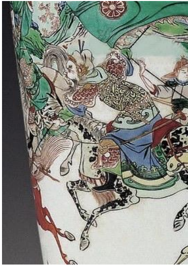
Figure 16 (Qing Dynasty) A five-color vase 'Three Young Men Battling Against Lv Bu' in Kangxi Regime (partial), Guardian, Spring 2003.