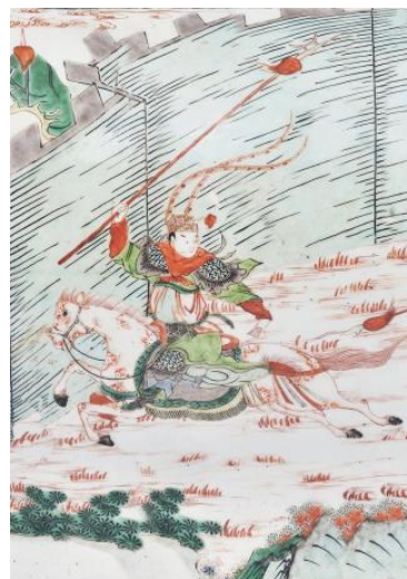
Figure 6 (Qing Dynasty) A five-color hat-covered jar 'Three Young Men Battling Against Lv Bu' in Kangxi Regime (partial), 45th, Fourth Season, Guardian, 2016.