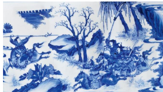
Figure 4 A vase 'Three Young Men Battling Against Lv Bu', blue and white porcelain "Romance of the Three Kingdoms" in Chongzhen Regime of Ming Dynasty (partial), collected in the Mus é Guimet, France.