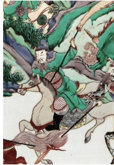
Figure 8 (Qing Dynasty) A five-color handicap 'Three Young Men Battling Against Lv Bu' in Kangxi Regime (partial), Beijing, Spring 2016.

Guan Yu, a widely known and a famous general of the Three Kingdoms, has been passed down to this day for his heroic image of righteousness, wisdom and courage. "He is tall (nine feet 3 inches), with a beard one foot 8 inches long, a jujube-colored face, vermilion lips, phoenix eyes, recumbent eyebrows, and an imposing appearance." 3 [2] According to this sentence, a depiction of Guan Yu from the "Romance of the Three Kingdoms" can be seen. In the following picture, it can be seen that the five-color porcelain Guan Yu in Kangxi Regime is more impressive, with a tall figure, riding on Red Hare and wielding Green Dragon Crescent Blade in the battle; his head is covered with a turban and conical cap, drawn with vermilion material and filled with ancient green; his eyes are phoenix-shaped, his eyebrows are crouching, his facial expression is serious and upright, and hundreds of beards are drawn with black vermilion material, so as to show his bravery; the rest of his features are painted in alum red; he wears a green brocade robe given to him by Liu Bei, filled with ancient green, which is worn but reflects his loyalty to Liu Bei and his brotherly love for him. ("Figure 8, "Figure 9", and "Figure 10")