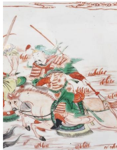
Figure 9 (Qing Dynasty) A five-color hat-covered jar 'Three Young Men Battling Against Lv Bu' in Kangxi Regime (partial), 45th, Fourth Season, Guardian, 2016.