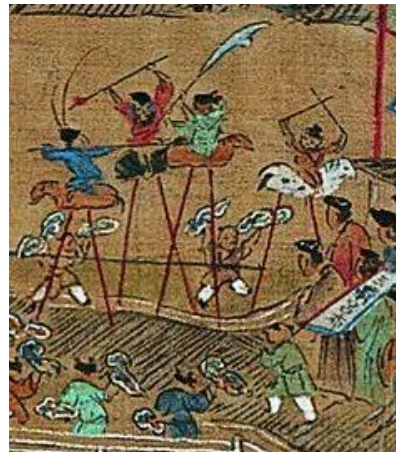
Figure 2 (Ming Dynasty) The scroll of prosperity in Nandu (partial), collected by the National Museum of China (44cm x 350cm).

In addition to the paintings, there are many sculptures, including stone, brick, wood, ivory and bamboo carvings. For example, the relief carving of 'Three Young Men Battling Against Lv Bu' on the Wenfeng Pagoda in Xilai Ancient Town, the brick carving of 'Three Young Men Battling Against Lv Bu' in the Chongming County Museum, the ivory carving of 'Three Young Men Battling Against Lv Bu' from the Qing Dynasty, and the bamboo carving of 'Three Young Men Battling Against Lv Bu' in the Qianlong Regime of the Qing Dynasty performed the art based on the theme of 'Three Young Men Battling Against Lv Bu'. The four famous generals of the Three Kingdoms were meticulously carved in terms of their demeanor, dynamics, costumes and weapons, all of which