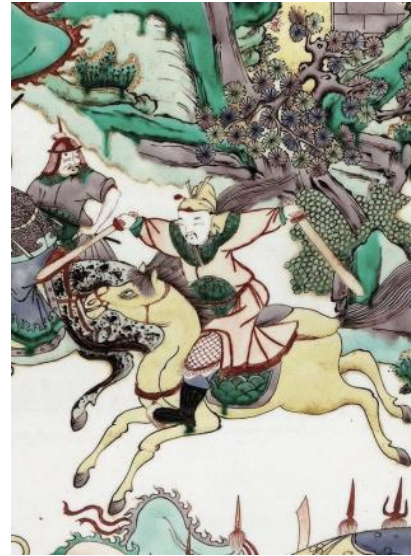
Figure 11 (Qing Dynasty) A five-color handicap 'Three Young Men Battling Against Lv Bu' in Kangxi Regime (partial), Beijing, Spring 2016.

Liu Bei is portrayed in the Romance of the Three Kingdoms as a benevolent monarch, described as He was tall of stature. His ears were long, the lobes touching his shoulders, and his hands hung down below his knees. His eyes were very big and prominent so that he could see backward past his ears. His complexion was as clear as jade, and he had rich red lips. 4 [2] Liu Bei is depicted in five-color porcelain in Kangxi Regime, his clothes are finely drawn, with many folds to show the folds; his body is smaller in size compared with Guan Yu. ("Figure 11", "Figure 12", and "Figure 13")