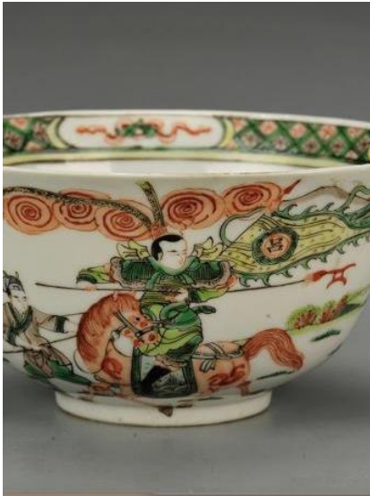
Figure 7 (Qing Dynasty) A five-color grain bowl 'Three Young Men Battling Against Lv Bu' in Kangxi Regime (partial), collected in Zhenjiang Museum.

Guan Yu, a widely known and a famous general of the Three Kingdoms, has been passed down to this day for his heroic image of righteousness, wisdom and courage. "He is tall (nine feet 3 inches), with a beard one foot 8 inches long, a jujube-colored face, vermilion lips, phoenix eyes, recumbent eyebrows, and an imposing appearance." 3 [2] According to this sentence, a depiction of Guan Yu from the "Romance of the Three Kingdoms" can be seen. In the following picture, it can be seen that the five-color porcelain Guan Yu in Kangxi Regime is more impressive, with a tall figure, riding on Red Hare and wielding Green Dragon Crescent Blade in the battle; his head is covered with a turban and conical cap, drawn with vermilion material and filled with ancient green; his eyes are phoenix-shaped, his eyebrows are crouching, his facial expression is serious and upright, and hundreds of beards are drawn with black vermilion material, so as to show his bravery; the rest of his features are painted in alum red; he wears a green brocade robe given to him by Liu Bei, filled with ancient green, which is worn but reflects his loyalty to Liu Bei and his brotherly love for him. ("Figure 8, "Figure 9", and "Figure 10")