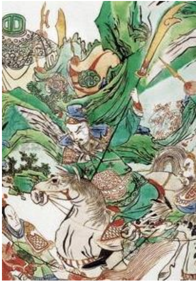
Figure 10 (Qing Dynasty) A five-color vase 'Three Young Men Battling Against Lv Bu' in Kangxi Regime (partial), Guardian, Spring 2003.

Liu Bei is portrayed in the Romance of the Three Kingdoms as a benevolent monarch, described as He was tall of stature. His ears were long, the lobes touching his shoulders, and his hands hung down below his knees. His eyes were very big and prominent so that he could see backward past his ears. His complexion was as clear as jade, and he had rich red lips. 4 [2] Liu Bei is depicted in five-color porcelain in Kangxi Regime, his clothes are finely drawn, with many folds to show the folds; his body is smaller in size compared with Guan Yu. ("Figure 11", "Figure 12", and "Figure 13")