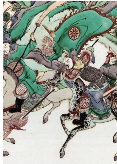
Figure 14 (Qing Dynasty) A five-color handicap 'Three Young Men Battling Against Lv Bu' in Kangxi Regime (partial), Beijing, Spring 2016.

Zhang Fei has always been praised for his powerful image as a General. It was described in the "Romance of the Three Kingdoms" that "he was eight feet long, with a leopard-shaped head and ringed eyes, tiger-style beard, a voice like a giant thunderbolt." 5 "Zhang Yide, a man of Yan state, held a spear, and his eyes were round." 6 [2] According to 'Three Young Men Battling Against Lv Bu', it can be seen that Zhang Fei ride on a piebald horse, his body leaning forward and lying on horse back, holding his spears in his hands; his eyes are big, his facial expression is fierce and courageous; his head is covered with a turban. ("Figure 14", "Figure 15", and "Figure 16")