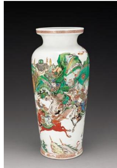
Figure 17 (Qing Dynasty) A five-color Pilgerflasche 'Three Young Men Battling Against Lv Bu' in Kangxi Regime (partial), 10th, Beijing Baoli.

battle. Besides, the banners and trees of various colours are used to decorate the scene, which not only heightens the fierce atmosphere of 'Three Young Men Battling Against Lv Bu', but also completes the composition. [6] The clouds in the sky are also painted in alum red, with a strong, smooth, and delicate brushwork, forming a complete scene of the characters. ("Figure 17", "Figure 18")