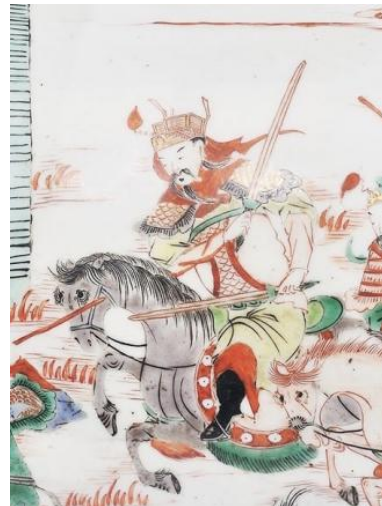
Figure 12 (Qing Dynasty) A five-color hat-covered jar 'Three Young Men Battling Against Lv Bu' in Kangxi Regime (partial), 45th, Fourth Season, Guardian, 2016.