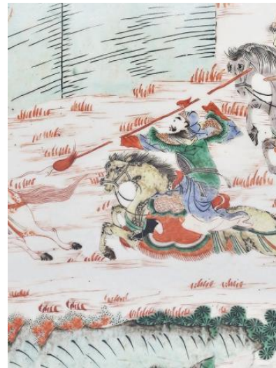
Figure 15 (Qing Dynasty) A five-color hat-covered jar 'Three Young Men Battling Against Lv Bu' in Kangxi Regime (partial), 45th, Fourth Season, Guardian, 2016.