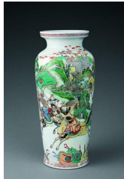
Figure 18 (Qing Dynasty) A five-color vase 'Three Young Men Battling Against Lv Bu' in Kangxi Regime, Guardian, Spring 2003.