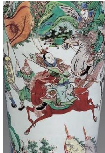
Figure 5 (Qing Dynasty) A five-color vase 'Three Young Men Battling Against Lv Bu' in Kangxi Regime (partial), Guardian, Spring 2003.

"He is wearing a purple and gold crown, a red brocade robe with hundred flowers, an armour with beast's face, a belt with lion, a bow and arrows, and an halberd, and a red hare. Indeed, "Lu Bu is prominent among men and Red Hare is outstanding among horses!" 2 [2] According to this sentence, it can be seen that Lv Bu was a dashing and valiant warrior. It can be seen from the figures below ("Figure 5", "Figure 6", and "Figure 7") that the purple gold crown on Lv Bu's head and hair is outlined with alum red, and then filled with gold powder; the face is exquisitely painted. The eyes, eyebrows and hair temples are painted with red clear, and the other parts are outlined with alum red to reflect the natural skin color. The robe with hundred flowers is hung on the body, outlined in lines, and then filled with water; the armor with animal face on the shoulder shows the hard texture by drawing the armor in the scale pattern, "human pattern", straight line and point. There are exquisite belts with lion patterns around the waist, which are expressed in the form of circles and squares, outlined with red clear and then filled with water material. Holding halberd in his hand, Lv Bu rode on Red Hare and fought and walked. After turning his side, he fought against the three brothers Liu Bei, Guan Yu and Zhang Fei, vividly depicting Lv Bu's bravery, majestic and dignified image of a military general.