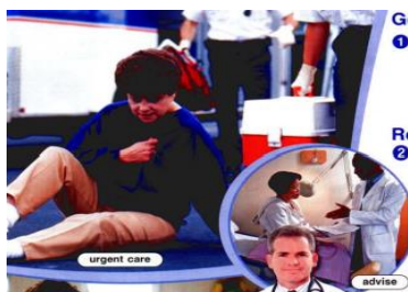
Figure 2 Theme 13

The second example of gender stereotyping can be seen in the following picture.