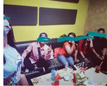
Figure 2 The atmosphere in the Karaoke Room

If the karaoke management hired the escort, they would have to pay 25% of their introductory rate to the management. For example, if their rate is Rp 100.000, they give Rp 25.000 to the karaoke staff. There is no fixed rule regarding revenue sharing (just the average calculation).