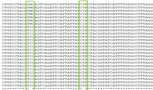
Figure 1 SNP identification by sample's sequence alignment in Clustal Omega program