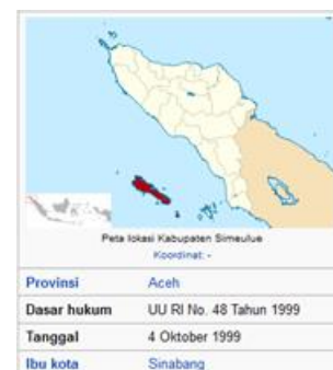
Picture 1.1 Simeuleu Island

independent under the name Simeuleu district. Figure 1.1 is a map of the location of Simeuleu Island in Aceh province. Simeuleu Island which is red (dark), and the small islands to the east are islands that belong to the Singkil district, one of which is named Pulau Banyak, which also has a Devayan-speaking community with different dialect variations. The following is the location of the island of Simeuleu which is on the map of the province of Aceh.