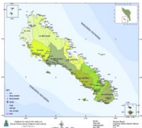
Picture 1.2 Districts in Simeulue Island

island, there are other islands including: Sumat island, Panjang island, Batu island, Teupah island, Mincau island, Simeulue Cut island, Pinang island, Dara island, Langeni island, Linggan island, Leukon island, Silaut Besar island, island Silaut Kecil (outermost island), Edge island, Ina island, Alafulu island, Turtle island, Tinggi island, Kecil island, Khalak-khalak island, Asu island, Babi island, Lasia island, and other small uninhabited islands. Figure 1.2 is a picture of the island of Simeulue which is located at the coordinates of 2015' - 2055' North Latitude and 95040'- 96030' East Longitude.