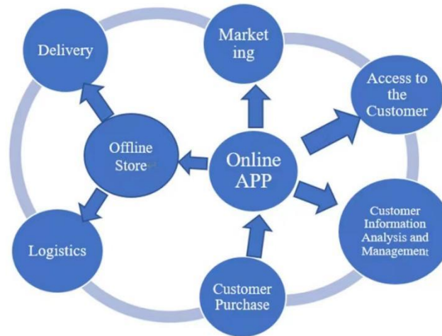
Figure 4 Luckin coffee's service mode

Figure 4 is Luckin coffee's service mode. In the current era of upgrading consumption structure, the rapid development of the Internet and big data, Luckin coffee adopts the new Internet retail business model of "Online + offline" synchronous operation[10]. This has broken the traditional coffee shop mode, which is designed to meet the diversified needs of consumers.