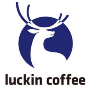
Figure 3 Luckin coffee's logo

brand marketing[8]. In short, brand promotion is conducive to the emotional resonance between consumers and coffee brand, which can attract more consumers and achieve brand communication.