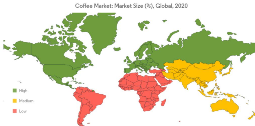
Figure 2 Coffee Market, 2020

and more attention from the Chinese people. Professional institutions predict that the scale of China's coffee market is expected to exceed 100 billion yuan by 2025. The data show that the annual growth rate of coffee consumption in China is 15% ~ 20%, while the global growth rate is only 2% [5]. These macro market conditions are undoubtedly great good news for Luckin coffee, a brand that has just entered the market.