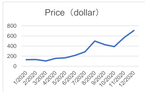
Figure.1 Monthly chart of Tesla's stock price for 2020.