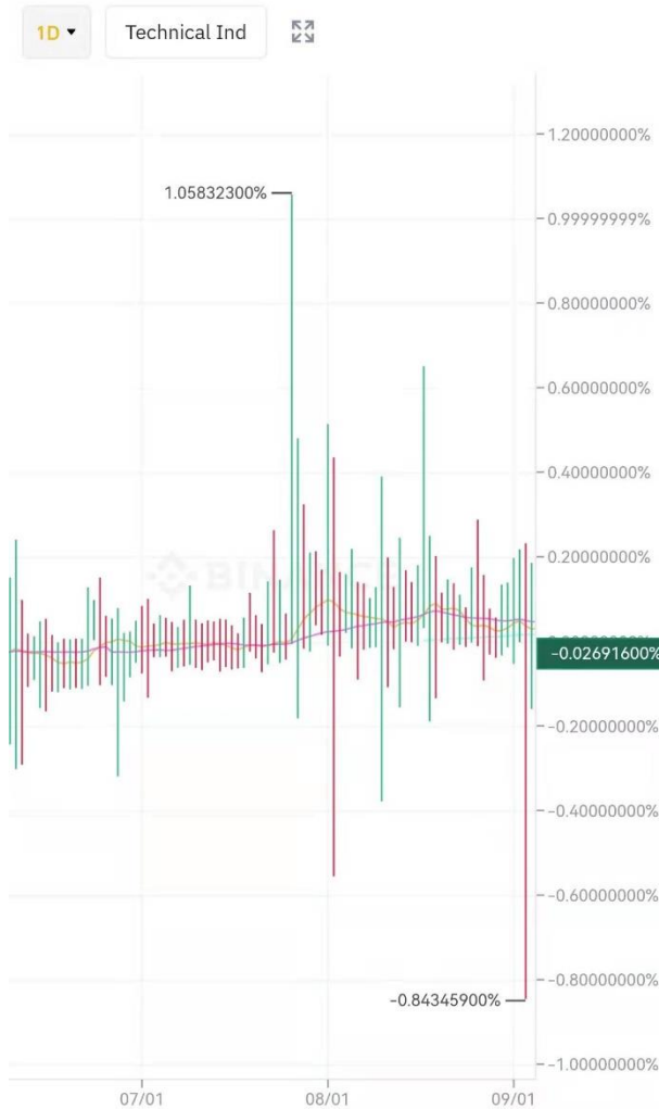
Figure 1 Bitcoin-USDT perpetual premium index 1st June 2021-1st September 2021.