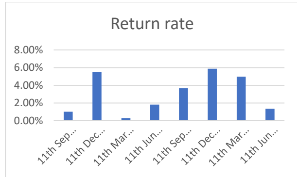
Figure 4 Return rates based on hypothesis investment portfolios

Furthermore, the shape historical BTC spot price curve is highly similar to the shape of the historical BTC/USDT perpetual contract funding rate. Comparing Figure 3 and Figure 4 it shows that the return rate does not highly concern with the BTC spot prices, but by comparing Figure 2 and Figure 4 it can tell that the return rates are highly related to the funding rates.