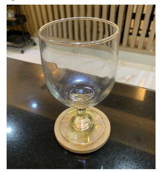
Figure 3. Examples of using Warak Ngendog coaster informal events

Brass metal can give a modern and luxurious impression and is suitable for formal situations. This is because the color of brass resembles the color of gold, so it is considered suitable for use in family banquets and other formal occasions. An example of its use is shown in Figure 9 below.