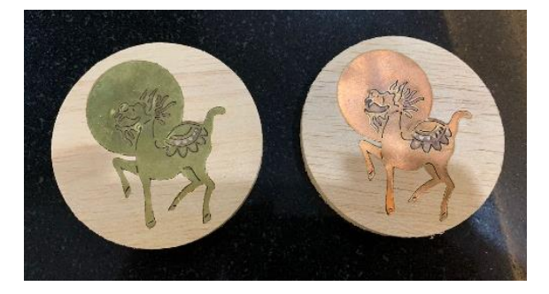
Figure 2. The Warak Ngendog motifs were tested on brass (left) and copper (right)

Based on the background that has been described, the results of the laser cutting and forging technique [13] experiments on metal are obtained as follows: