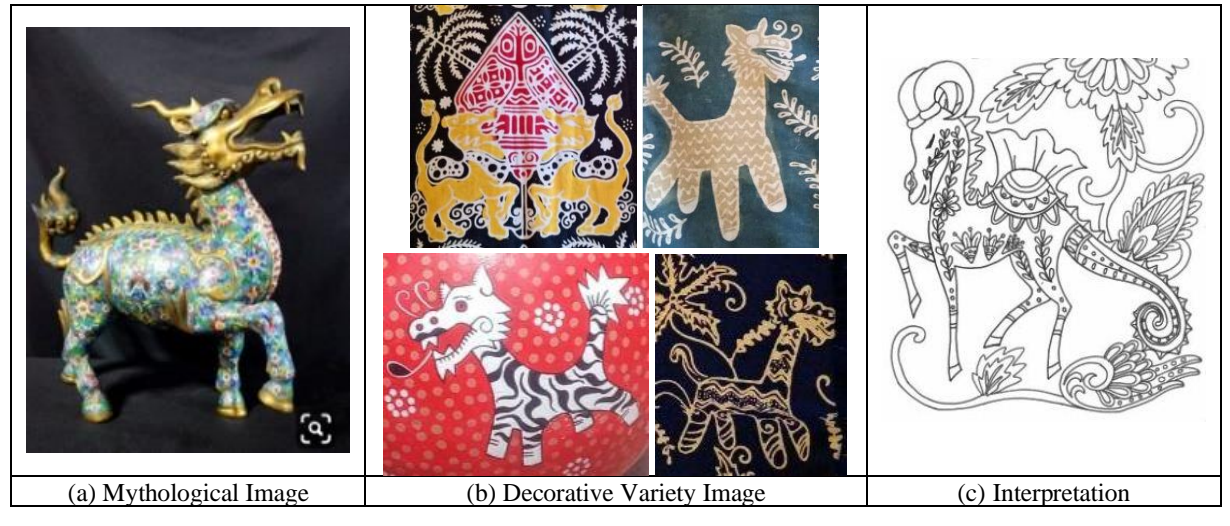
Figure 1. Changes in Interpretation of the Warak Ngendog Image

Based on the two tables regarding the interpretation of Warak Ngendog above, the design results for coasters are obtained based on certain stylized forms from existing motifs. The decorative elements contained in the Warak Ngendog motif, as shown in Figure 1 above, consist of several types of motifs as follows: