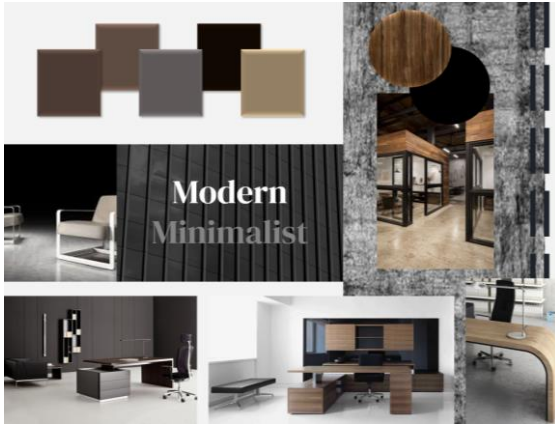
Figure 2 Furniture Design Concept Mood board

The design concept in the design of multifunctional furniture is modern but does not leave a minimalist impression. The concept creates elements of style, theme, and material.