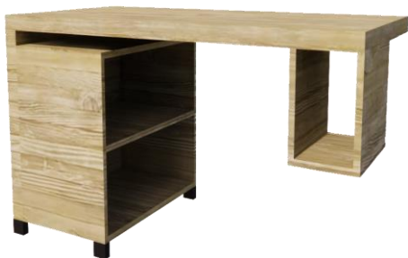
Figure 7 Office table

This furniture is made with a multifunctional concept with the aim that users do not need to spend time going to the locker area to pick up items. This furniture is also made with a cubical concept in accordance with current evolution, such as covid 19. Making with cubical concept has the aim of minimizing the spread of the virus directly so that users feel safe and comfortable.