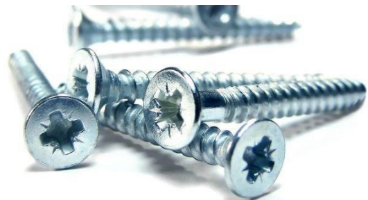
Figure 5 Screws for connection between wood

Most of the connections use screws and the drawer is left open to minimize cramping in the work area.