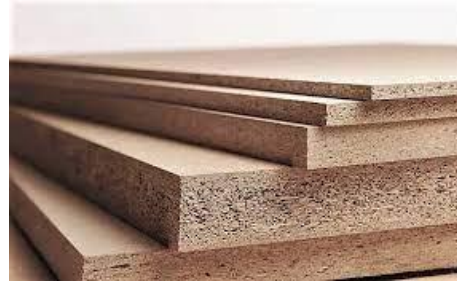
Figure 3 Medium Density Fiberboard (MDF)

The materials used are mostly processed wood materials such as Medium Density Fiberboard (MDF). The designers uses Medium Density Fiberboard (MDF) as the main material in this office furniture because according to the Low Cost Furniture Contributor (2018), MDF is environmentally friendly and relatively cheaper than plywood [10].