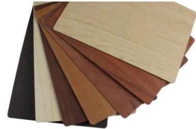
Figure 4 High Pressure Laminate (HPL)

Then the finishing section is given HPL (High Pressure Laminate) with a wood texture and softgrey colors. According to Dekoruma.com, High Pressure Laminate (HPL) is one of the most popular processed wood finishes, because High Pressure Laminate (HPL) has many variations, and installation is also easy [9].