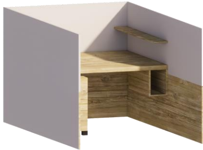
Figure 6 Multifunction Furniture

This furniture is made with a multifunctional concept with the aim that users do not need to spend time going to the locker area to pick up items. This furniture is also made with a cubical concept in accordance with current evolution, such as covid 19. Making with cubical concept has the aim of minimizing the spread of the virus directly so that users feel safe and comfortable.