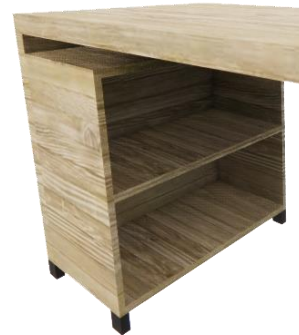
Figure 9 that drawers is used to store things

The advantages of this furniture is that it can be used as a work area, then it can also be used as to store item such as files as in Figure 9 , and can put supplies or a drink in the places that shown in Figure 10 .