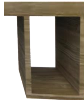
Figure 10 rack is used to put food or drink

Meanwhile, in partition selection on Figure 11 , there are additional of shelves so that users can put decorations so that the working atmosphere is more lively and not too monotonous.