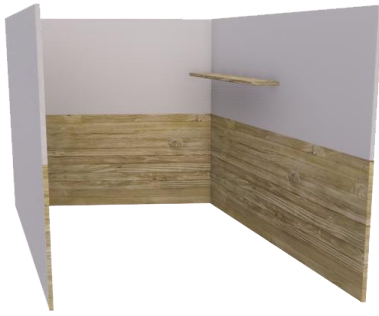
Figure 11 Partition