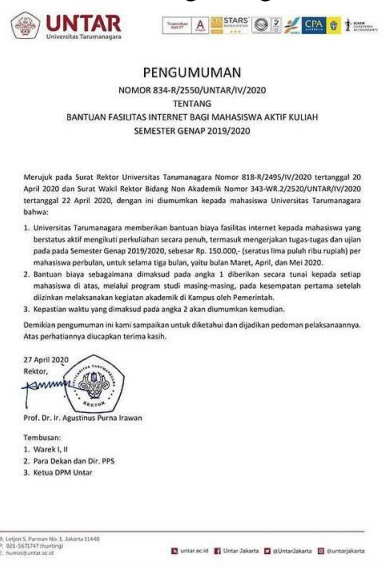
Figure 8. Fifth Circular regarding Corona Virus