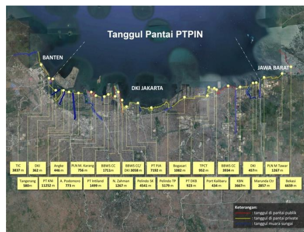
Figure 1. Location of Dike Coastal Development in Jakarta Bay

The research method used in this study is a qualitative descriptive method [15]. Data collection techniques are carried out using literature review, in-depth interviews, and field observations. The three methods of data collection are carried out combinative in completing the required data. Data was collected through the DKI Jakarta Regional Government, officers of Ciliwung Cisadane River Region Central Office, officers of Neighborhood Association and Citizens Associations, fishermen, businessmen, Fish Auction officers, and community leaders. The literature review is used at an early stage to collect secondary data related to the location and development of coastal embankment development. In-depth interviews are used to gather information from both relevant agencies and the public. While field observations are used to directly observe the condition of the location and the dynamics of community life directly at the two coastal dike development sites.