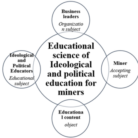
Figure 1 The process of miner's ideological and Political Education