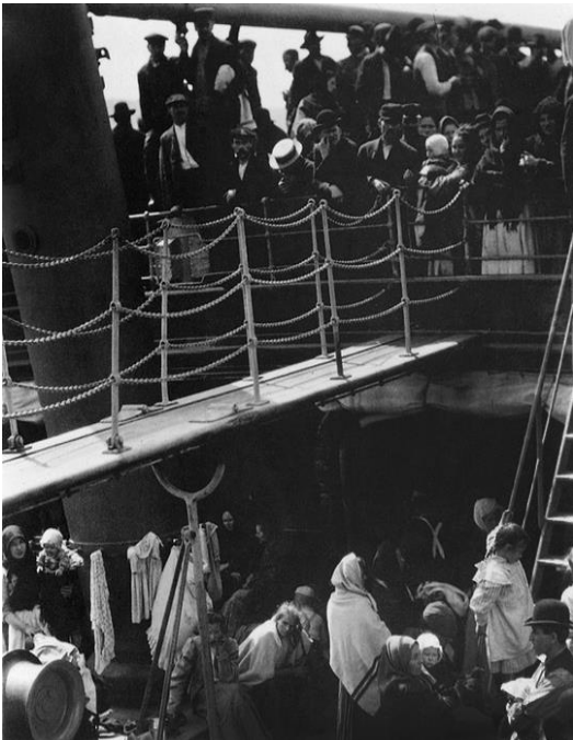
Figure 5 Stieglitz Lower class 1907

obtained by artificial control of technology. That is to say, the concept of obtaining artistic identity by sacrificing the accuracy of the image itself has been abandoned by direct photography. This should be a major progress in the concept of photography, which not only means that photography has made new progress in exploring its own media characteristics, but also means that photographic images as symbols transcend the deep ideographic function of the image surface. When Stieglitz travelled to Europe on the "Emperor Deutsche William II" liner in 1907, he took an expressive picture of Lower warehouse (The Steerage, 1907) (Figure 5). This photograph is usually regarded as the iconic work of Stieglitz's transformation from freehand photography to direct photography. This change is from the symbolic theme of painting style.[5]