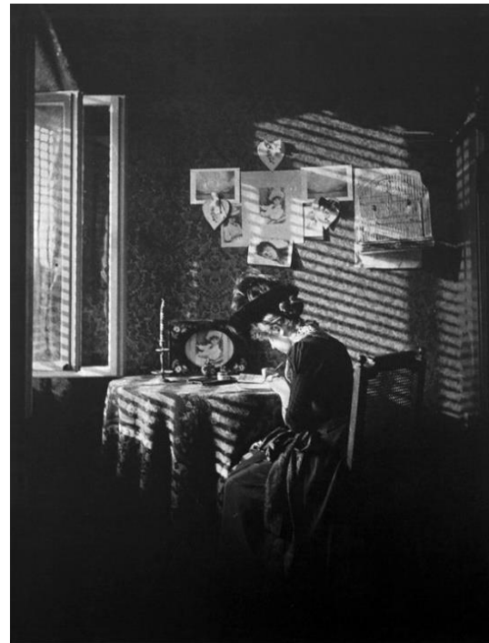
Figure 4 Stieglitz The light of the sun 1889

concept of “separation” to American politics. This term itself indicates the incitement and provocation of this movement after careful consideration in the modern sense. Stieglitz divided photographers into three categories : ignorant photographers, pure technical photographers and art photographers. In his eyes, the separatists and the photographers who advocate freehand photography are undoubtedly in line with the third type of photographers. That is to say, in the eyes of the separatists, photography equipment includes lenses, cameras and films, etc. They make full use of these tools and adopt complex production methods to achieve their artistic purposes. Most freehand photography pursues the image effect of soft focus, because the high sharp image is clear and more suitable for reproducing the true details. The soft-focus image is blurred. There is a hazy beauty similar to impressionist painting, which is more suitable for achieving the effect of painting ( Figure 4 ).