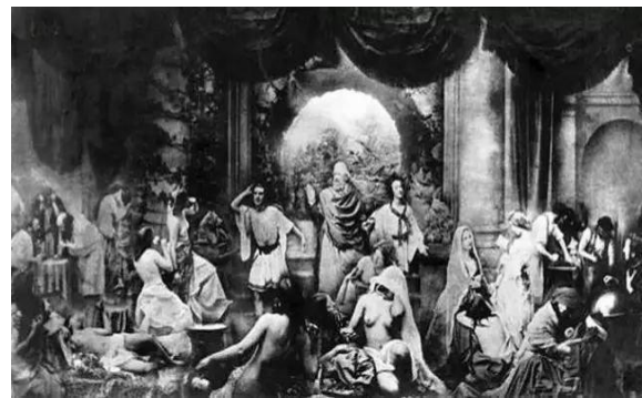
Figure 2 Relander Two Ways of Life 1853

rather than showing people's ideal for beauty. The rise of high art photography has become a powerful counterattack against the idea of excluding photography from the art palace. After 1853, with the popularity of photo printing, some British photographers, with the purpose of pure aesthetics, began to intentionally create artistic photographs, and gradually developed into a high art photography school represented by Oscar Gustav Relander, Henry Page Robinson, William Luck Price and Julia Margaret Cameron.[2]