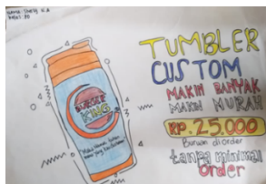
Figure 2 Example of student-written ad text

Based on Figure 2, the results of writing skills with a multiliteracy model must understand the advertisement text. The type of writing that students can develop is in the form of text products and advertisement images with varied writings. The image in the advertisement text are varies. The sentences in the advertisement are concise, clearly on target. Students can use appropriate persuasive sentences.