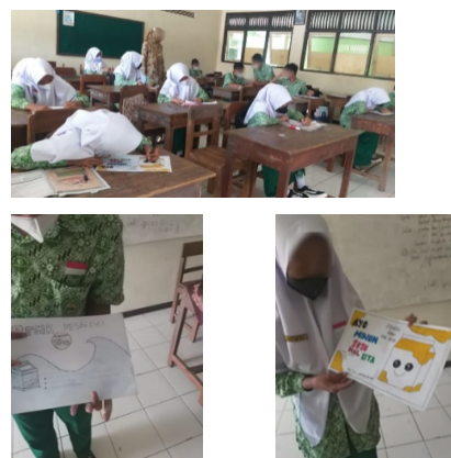
Figure 1. Students working on assignments

The next stage that the teacher does is assigning the task to the students to write the advertisement text independently according to the structure and linguistic rules of the advertisement text. This assignment is used as a formative test (as a final evaluation). During the process of giving the task, the teacher guides students around in compiling the advertisement text which is done independently by the students. The stage of communicating advertising text products is the final step of the ad text-based multiliteracy model. Pictures of the implementation of the task by students can be seen in Figure 1.