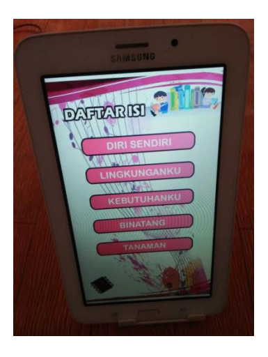
Figure 2. Digital Songbook Form

Based on the findings of research and development conducted [5] during the offline learning period, it was determined that the Digital SongBook was usable, with 75 percent validity and 85 percent practicality. This means that, at this early stage of development (prior to the pandemic), this media is feasible and practicable for use in thematic learning in Kindergarten.