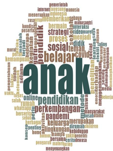
Picture 3. Word Cloud Word Frequency Query “Pembelajaran Selama Pandemi”

The results of the Word Frequency Query that appear in Table 3. and Figure 3. show that the previous articles that discussed children's learning during a pandemic owned by children this age will not be far from children, learning, education, social, educator, development, process, friends, teacher, behavior, family, method [13], [19], [32], [38], [43]–[45]. These results are analyzed in this article based on changes in learning that occur in social behavior, especially early childhood. Nowadays learning is done online, online learning has an impact on children's emotional social behavior such as children being less cooperative because children rarely play together, lack of tolerance, lack of socializing with friends, limited learning at home, children's emotions