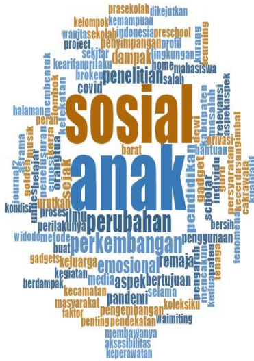
Picture 2. Word Cloud Word Frequency Query Result “Perubahan Perilaku Sosial”.

The results of the Word Frequency Query that appear in Table 2. and Figure 2. show that the previous discussion on the internet regarding changes in social behavior during the pandemic discussed more about children, social, change, development, emotional, research, education, impact, youth, science, pandemic, covid, gadgets, family, media, parents. These findings form the basis of the analysis carried out to see changes in social behavior that occur in early childhood.