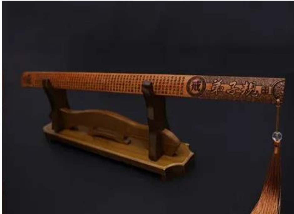
Figure 2 The plamer

is because they feel stressed about raising students' grades, so they beat students for the purpose of beating animals that wouldn't move forward.