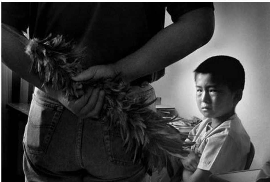
Figure 3 The sad Chinese children facing corporal punishment

Thirdly, corporal punishment has already become one part of the Chinese education culture. In Chinese history, people can easily find that the application of corporal punishment was very common between elder people like teachers and parents to children. There even have a special apartments for punishing students in Ming Dynasty. Student who didn't respect to teacher or do other thing wrong will be punished in these apartments.