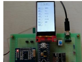
Figure 2 Test rendering

After powering up the system, the seat display shows no reservation. Through the mobile phone APP reservation, show the reservation, waiting for the swipe card unlock system. After swiping the card, the system is in good working order, time and charge start, ultrasonic module start measuring distance, and display lighting mode and current brightness. The hardware test rendering is shown in Figure 2.