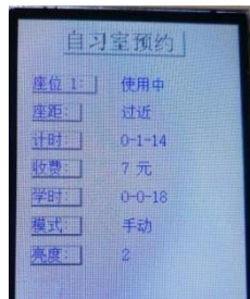
Figure 3 Effect Diagram of monitoring function

performance. The light can be turned on and off normally in automatic and manual mode, the ultrasonic module shows the monitoring distance is too close within 20 cm, and more than 20 cm shows the specific data. Light Press, do not press the pressure sensor, the system does not carry out time monitoring, press the pressure sensor system to carry out time monitoring. The results of the learning monitoring function test in the study room are shown in Figure 3.