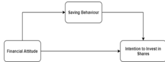
Figure 1. Research Frameworks