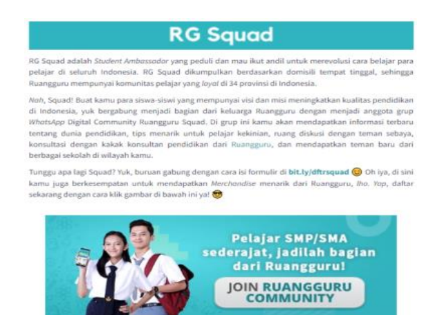
Figure 4. Ruangguru Community

Relational equity is significant. It happens when customers tend to keep in touch with the suppliers entirely based on habits. Thus, Ruanggururu formed an online community called RUANGGURU COMMUNITY. The appeal of consumers towards Ruangguru Online Tutoring services tends to increase every month in 2020 show by Figure 4, Figure 5, Figure 6.