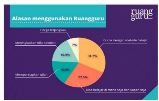
Figure 2. Survey Reasons for Kengguna Ruangguru

Scalar variables and physical constants should be italicized, and a bold (non-italics) font should be used for vectors and matrices . Do not italicize subscripts unless they are variables. Equations should be either display (with a number in parentheses) or inline. Use the built-in Equation Editor or MathType to insert complex equations.