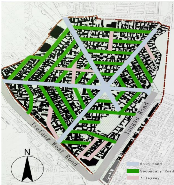
Fig. 3. Street classification of Liuxing Street

singing, crisscross river network, willow spring breeze, apricot blossom drizzle, three steps and two bridges, one step and one scene", taking its likeness to create the south of the Great Wall with the unique characteristics of Yili border city.