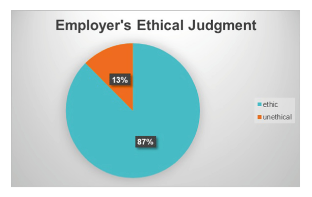
Fig. 2. Employer's Ethical Judgment