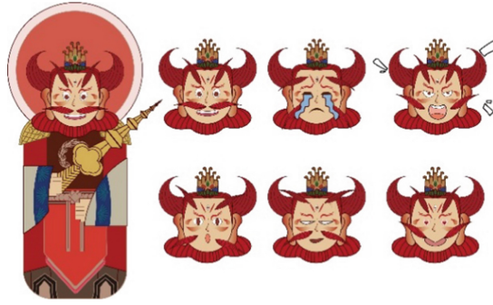
Fig. 3. LINGGUAN character design and emoticons.