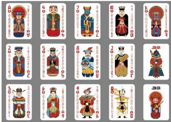
Fig. 4. Character design and play card application.

cultural content under the context of mass consumption. The main methods are user demand research, user experience, creative design, model method, cultural translation is the main thing. IP development content is divided into two categories: digital products and material products. The former is mainly in the form of video games, emoji language, user interface design, animation films, etc.; the latter is mainly in the form of film and television cultural derivatives, daily necessities, holiday gifts, teaching Supplies, special product packaging design, etc., for example, For example, the characters in the panwang festival portraits were be character design and integrated into playing cards, each playing card has different roles and role-specific functions (Fig. 4). The two are integrated with each other.