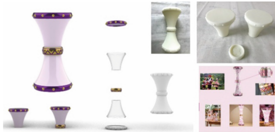
Fig. 2. Design work for long drum applied on cup and food packaging.

enhances the recognition of ethnic food (Fig. 2). About the digital space, its functional transformation is more diversified, and it exists in various forms such as video game props, architectural modeling, animation scenes, and expression packs.