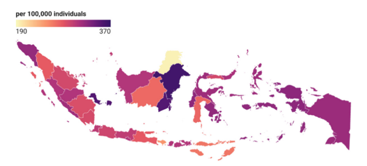
Fig. 1. Age-standardized incidence rate Stroke 2019

of prevalence. With 361.6 (319.9–410.0 95% UIs) and 195.0 (172.6–222.5 95% UIs) per 100,000 individuals, respectively, East Kalimantan had the highest and North Kalimantan had the lowest stroke incidence rates (Fig. 1). The highest and lowest incidences of intracerebral haemorrhage were 151.5 (129.1–176.8 95% UIs) per 100,000 individuals in South Kalimantan and 69.9 (59.4–82.2 95% UIs) per 100,000 individuals in North Kalimantan, respectively. Ischemic stroke incidence rate ranges from 112.4 (93.7–135.6 95% UIs) in North Kalimantan to 199.8 (166.0–243.9 95% UIs) per 100,000 individuals in East Kalimantan. The province of North Kalimantan had the lowest incidence of subarachnoid haemorrhage, with 12.7 (10.5–15.4 95% UIs), and North Maluku had the highest, with 17.2 (14.5–20.3 95% UIs) per 100,000 individuals (Table 1).