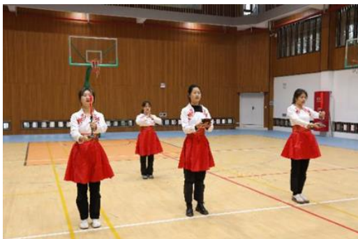
Figure 2 Songjiang "Grass dragon dance" ceremony