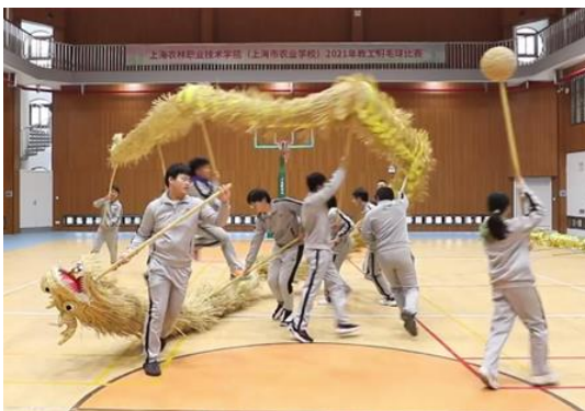
Figure 3 Songjiang "grass dragon dance" basic technology