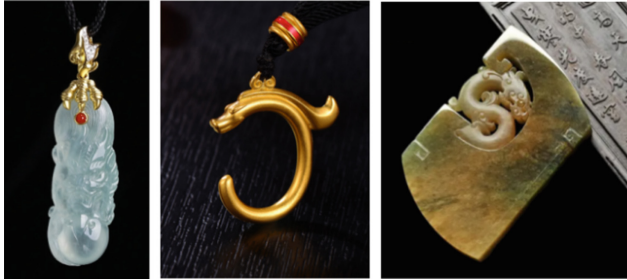
Fig. 2. Dragon jewelry designed by Chinese people.

In addition, the Chinese people are more proficient in the application of materials. Compared with the gold, silver, jewelry, agate, jade and other materials used by international famous brands, jade can better reflect the cool and cold temperament of the dragon. On the contrary, the dragon shaped jewelry inlaid with pearls and jewels has an unbearable look. In addition, the Chinese are better at using metaphors, so that users can know the whole picture at a glance. Therefore, it has more reference significance for the design of Chinese jewelry. Therefore, the design of Chinese jewelry has more reference significance.