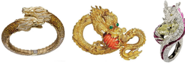
Fig. 1. Dragon jewelry designed by international famous brands.