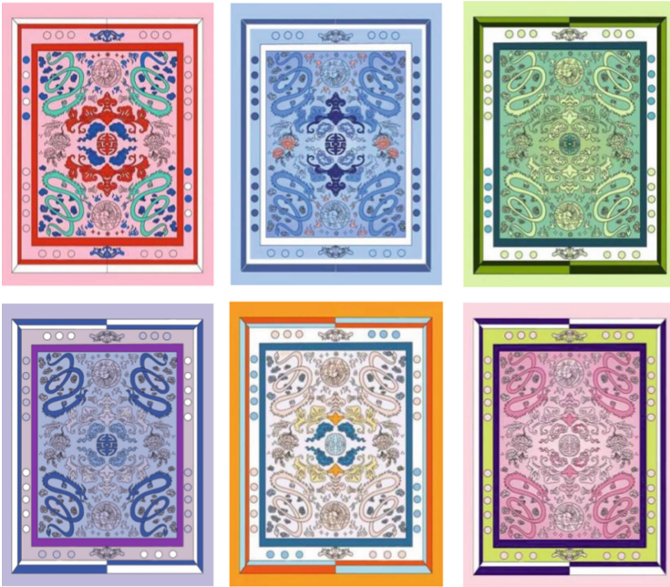
Fig. 4. Design chart.