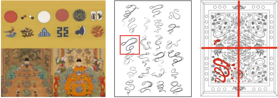
Fig. 3. Inspiration and design sketch. Image source: Drawn by myself.

rich imagination and bold deformation of empathy to transform bats into spirits with auspicious meanings and integrate them into people's lives. They can be seen on brick carvings, stone carvings, paper cuts and window grilles. And the auspicious meaning of bats will be passed down from generation to generation with the passage of time.