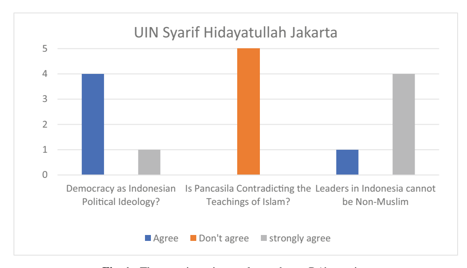
Fig. 1. The questionnaire results on the moRA's version

The following is the questionnaire results on the moRA's version of the indications of religious moderation which underwent several editorial changes that were adjusted by the ministry of religion version (Figs. 1, 2, 3 and 4).