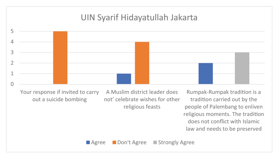
Fig. 4. The questionnaire results on the moRA's version

The table gives the message that all the students who sampled this study have not been among those who have a moderate attitude toward religion as a whole or in full. Thus, this provides clues to the importance of carrying out socialization movements of religious moderation as an effort to inversion-radicalization movements in the higher education area, especially at UIN Syarif Hidayatullah Jakarta.