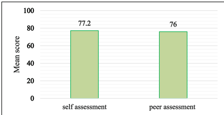
Fig. 3. The mean score of scientific workability

laboratories conventional [15, 35, 37]. Students are satisfied with their project laboratory work, they acquire the skills needed to face the challenges of their future profession. The knowledge and skills he has acquired are of course maintained and developed continuously. The previous finding was that free inquiry promotes the development of transversal skills, the ability to take responsibility for autonomy, develop self-reflection skills, work cooperatively and increase knowledge retention for the long term [29].