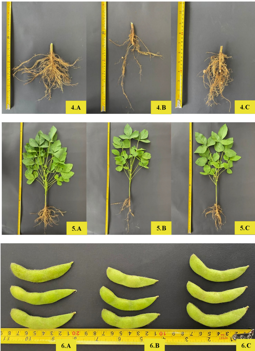
Fig. 2. Performance of roots (4), plant structure (5) and pods (6) of edamame. Note: treatments of goat (A), cow (B), and chicken manure (C).

[29] reports that application of goat manures was significantly improving relative root elongation on commercial commodities such as Chrysanthemum indicum L., Raphanus sativus , Brassica rapa , Sesamum indicum L., and Daucus carota . Macronutrients such as N and P elements had magnificent and beneficial effect on both aerial and root growth.