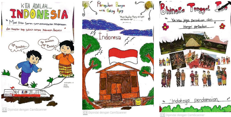
Fig. 4. Posters Series 3