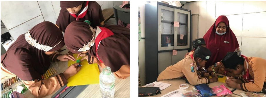
Fig. 2. Poster Making Process

third stage, namely making poster series 2. The results of poster series 1 and poster making activities can be seen in Figs. 1 and 2.