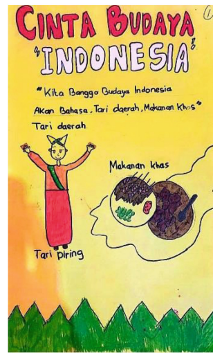
Fig. 3. Posters Series 2