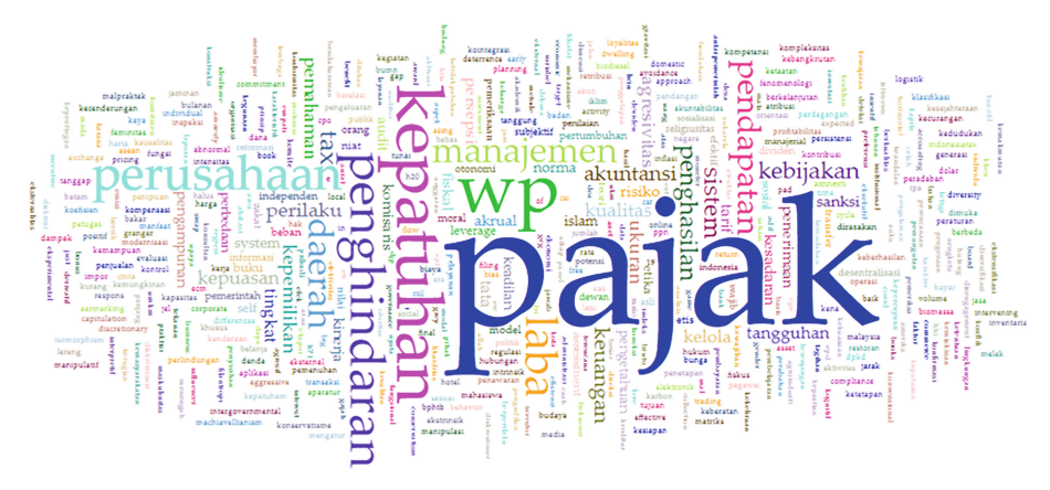
Fig. 1. Display of word sets in cirrus 2002–2021.

journal, such as writers, journal managers, editors, and article reviewers. For temporary publications that have not yet completed information related to this matter, it is recommended that it be completed as soon as possible to prevent any acts of abuse or copyright infringement related to plagiarism, duplication, or fabrication. There is only 1 periodical that still does not provide information, namely AKRUAL: JOURNAL ACCOUNTING should be hastened to be completed and updated on the website regarding the ethical information of scientific publications.