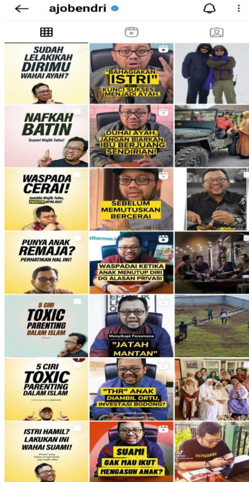
Fig. 1. Instagram account of @ajobendri

From Fig. 2, we see the content posted by the Instagram account @ajobendri which contains a discussion about parenting.