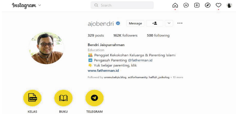
Fig. 2. Feed of @ajobendri